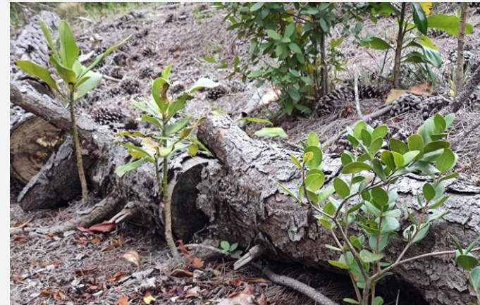
Regeneration of native vegetation

In 2023 the Project will achieve 100 ha controled